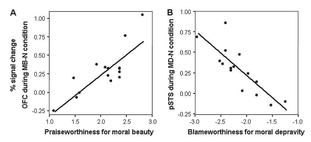
Figure 3. Regression lines of correlations between ( A ) praiseworthiness ( B ) blameworthiness and degree of brain activation. ( A ) There were correlations (r = 0.82, degrees of freedom [df] = 13, P < 0.001) between self-rating of praiseworthiness and degree of activation in OFC. ( B ) There were positive linear correlations (r = -0.83, df = 13, P < 0.001) between self-rating of blameworthiness and degree of activation in pSTS.

Moral depravity produced activation in the pSTS and MPFC, and the degree of pSTS activation was correlated with blameworthiness. Originally, STS was known to be activated by biological motions such as movement of eyes, mouth, hands, and body (Allison et al. 2000), and it has been suggested to have a more general function in social cognition such as detecting behavioral information that signals the intention of others (Gallagher and Frith 2003) and behavior of agents (Frith U and Frith CD 2003). MPFC appears to be responsible for inferring the cause of others' behavior, attribution. Previous studies have shown activation in the MPFC during judgments made on the basis of attributional information (Amodio and Frith 2006). It is suggested that, for the evolution and persistence of cooperation, humans have evolved neurocognitive systems that specialize in the detection of cheating and that motivate people to blame and punish those who violate social norms (Cosmides and Tooby 1992). Supporting this view, recent fMRI studies reported activation in brain regions such as the pSTS and MPFC during detection of the violation of social contracts (Canessa et al. 2005; Fiddick et al. 2005). Considering the functions of pSTS and MPFC, these regions might process intention of wrongdoings and, consequently, blameworthiness might be associated with the activation in pSTS.