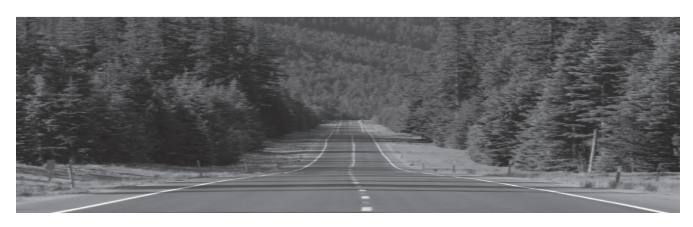
Fare Well May you and all beings be happy, loving, effective, and wise.

\dots [In sum], happiness is probably an important positive emotion for health."